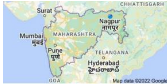
Figure 1 - Location of Nagpur in Maharashtra

The survey of avian biodiversity of Ambazari lake, Nagpur was conducted from the month of 85 March 2022 to April 2022 consecutively for 2 months. The study was conducted for two to three hours in the morning and in the evening time. The study area was visited in the morning and evening time when the birds are most active. Birds noticed were recorded by regular visits. The birds were observed and recorded in and around the Ambazari lake, as it is surrounded by the Botanical Garden, Nagpur university campus, L.I.T campus, Futala lake and Telangkhedi garden along the periphery.